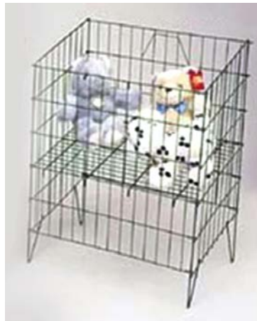
Square Dump Bin