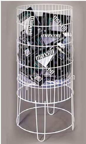
15" Round Dump Bin #RDB-1532

These Round Display Dump Bins give you another great way to increase impulse Sales!