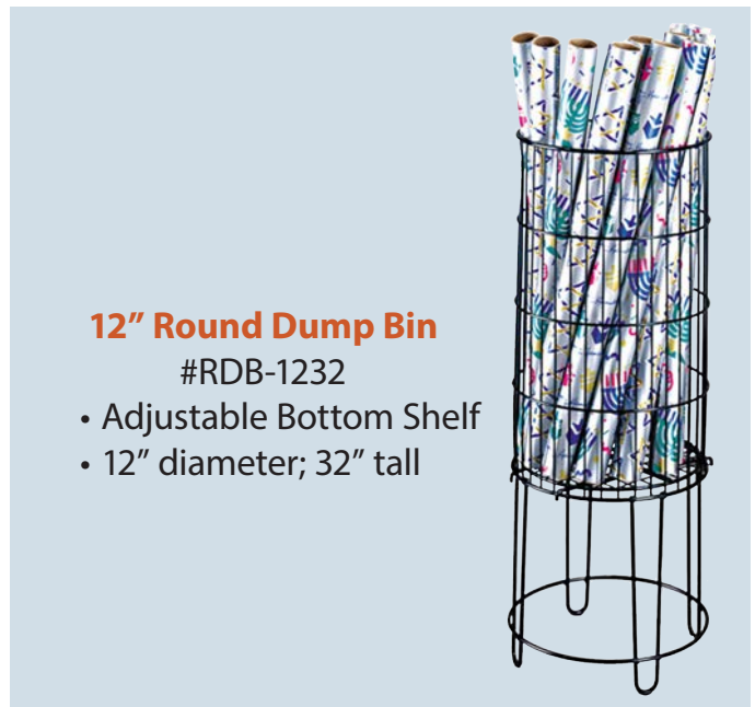
12" Round Dump Bin #RDB-1232