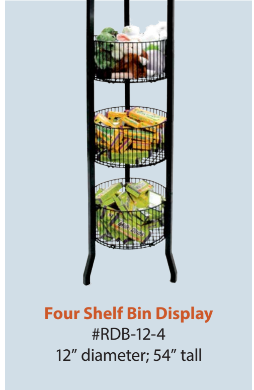
Four Shelf Bin Display #RDB-12-4 12" diameter; 54" tall