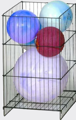
18" Bin Display