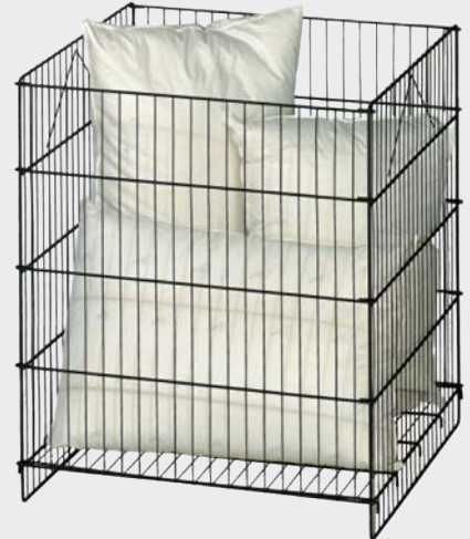
24" Bin Display