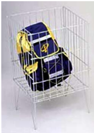
Rectangle Dump Bin