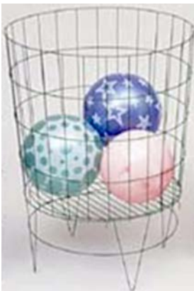
20" Round Dump Bin #RDB-2030