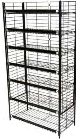
72" tall x 36" wide, 7 Shelves Model #PR72-36-7S

Optional Casters Shown (caster sets ordered separately)