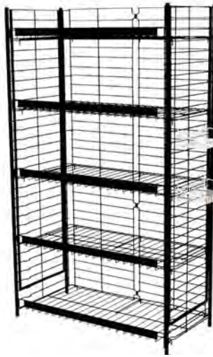
64" tall x 36" wide, 5 Shelves Model #PR64-36-5