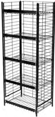
64" tall x 24" wide, 5 Shelves Model #PR64-24-5S