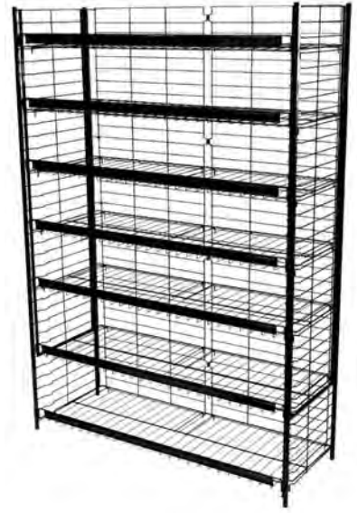
72" tall x 48" wide, 7 Shelves Model #PR72-48-7S