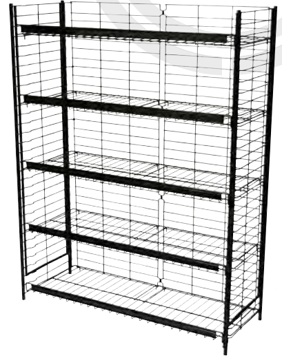
64" tall x 48" wide, 5 Shelves Model #PR64-48-5S